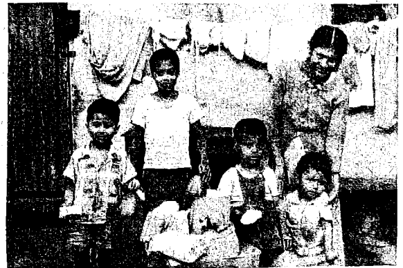
Sometimes hungry, but happy

"Oh, yes," replied the parents, "it's that sometimes there isn't enough to eat for supper and the children are still hungry and crying for more food. So we begin to sing hymns, and they join with us happily and forget their misery.